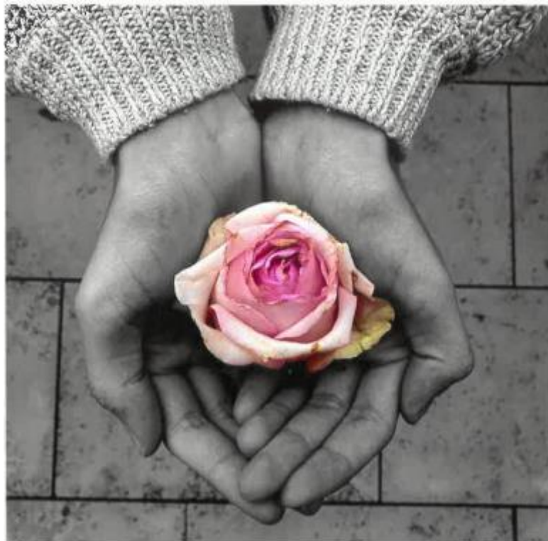
Maja Hofner, course 1e1

The world stands still for me everyone is rushing by can't breathe, can't see anything it's so loud, but I am quiet listen no one has time to notice beauty music birds singing they're just walking by, going to work appointments, home unimportant a single flower grows in a grey world colour I'm watching a butterfly in a destroyed world made by humans.